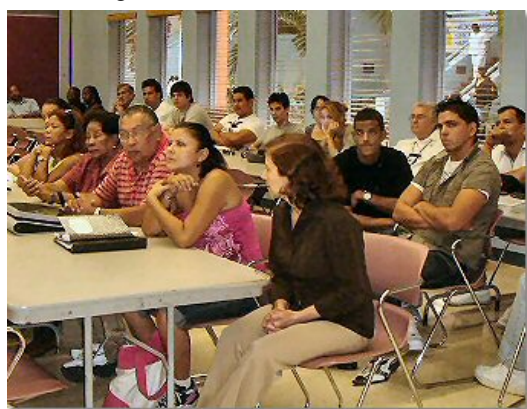
Students at Robert Morgan actively participated in the World Refugee Day celebration

The SAVES Program, along with Miami Dade County Public Schools, has made a tradition out of celebrating World Refugee Day. This year, various schools and staff members organized events aimed at highlighting the impact refugees make on a daily basis to our society and providing our SAVES clients with a wealth of information concerning social services.